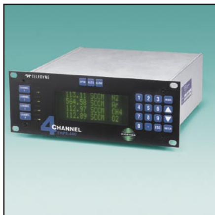
Power Supplies Available